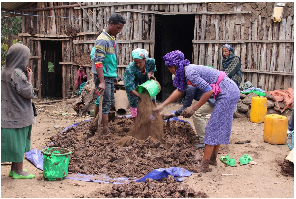
Mixing clay with ash and sand

See also the video https://www.youtube.com/watch?v=s2-B-MfFvTk