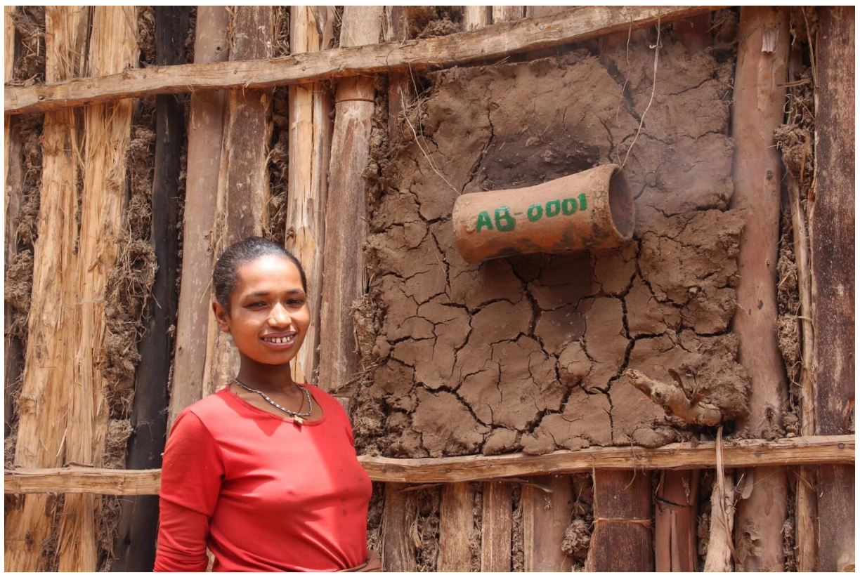
The outlet is ready to conduct the smoke through the wall out of the dwelling