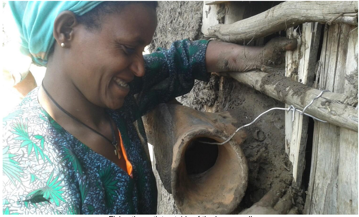
Fixing the outlet outside of the house wall