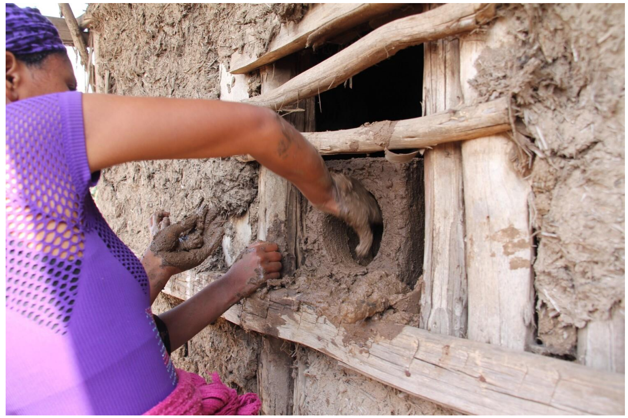
Making the hole through the housewall to fix the outlet