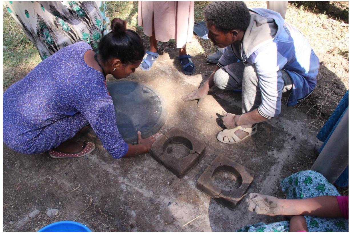
The chimney-bricks are air-dried, not fired