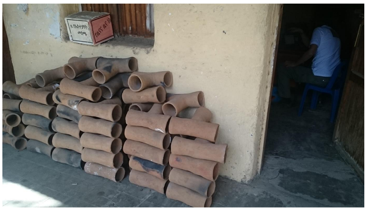
The outlets, which are fixed outside of the house wall, are made from fired clay