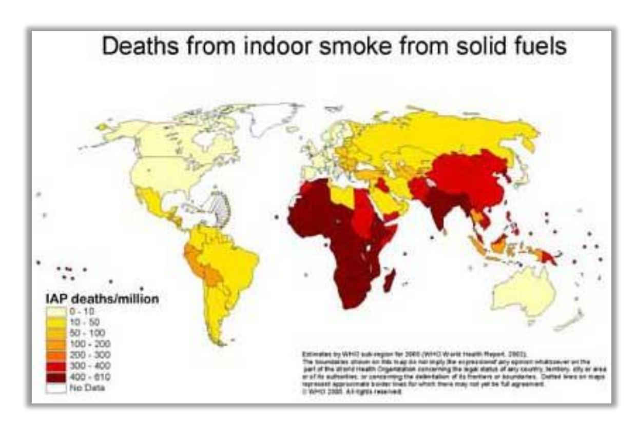
Figure 1: Deaths from indoor smoke from solid fuels

In 2016, household air pollution was responsible for 3.8 million deaths, and 7.7% of the global mortality.