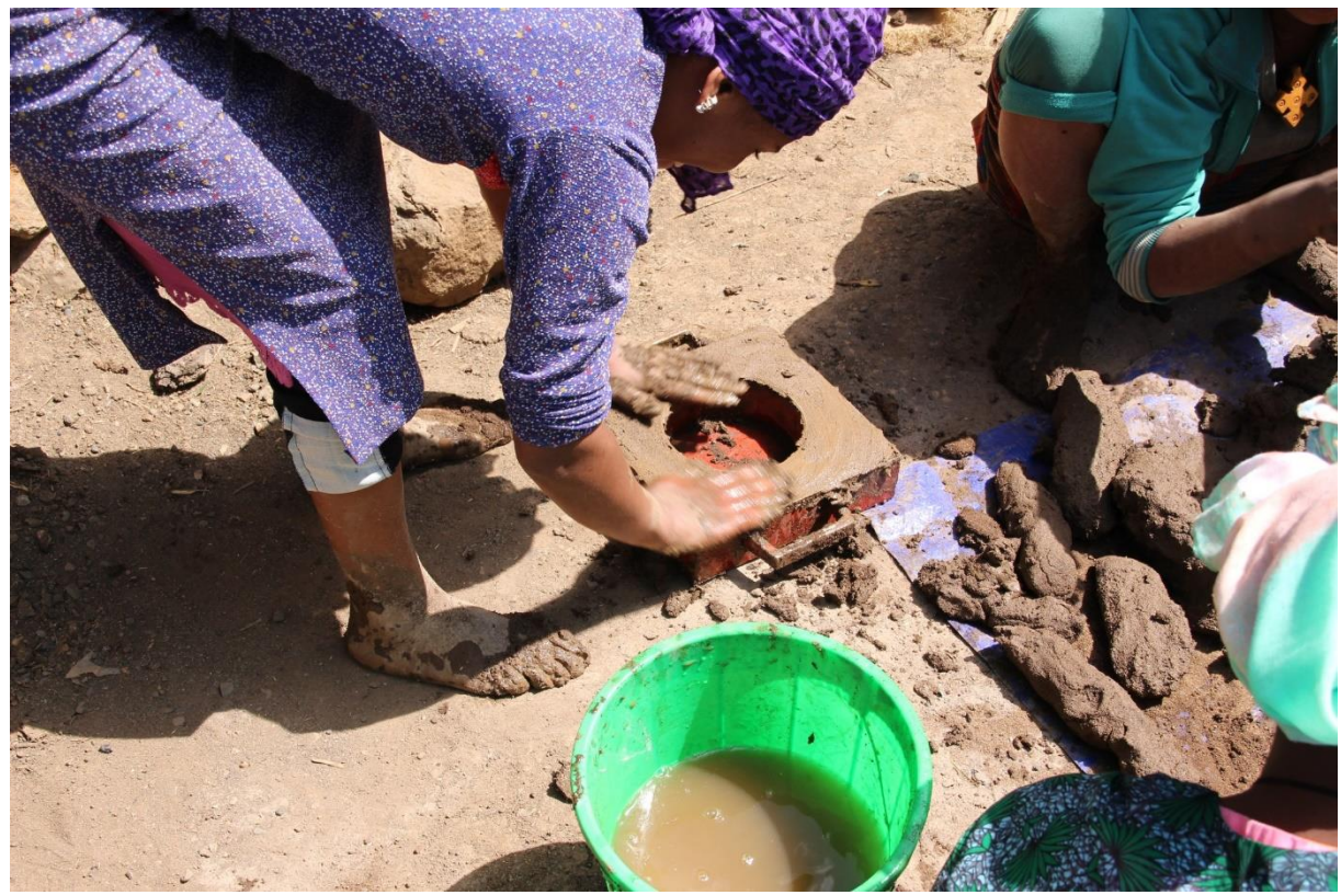
Making clay-bricks for the chimney with special molds