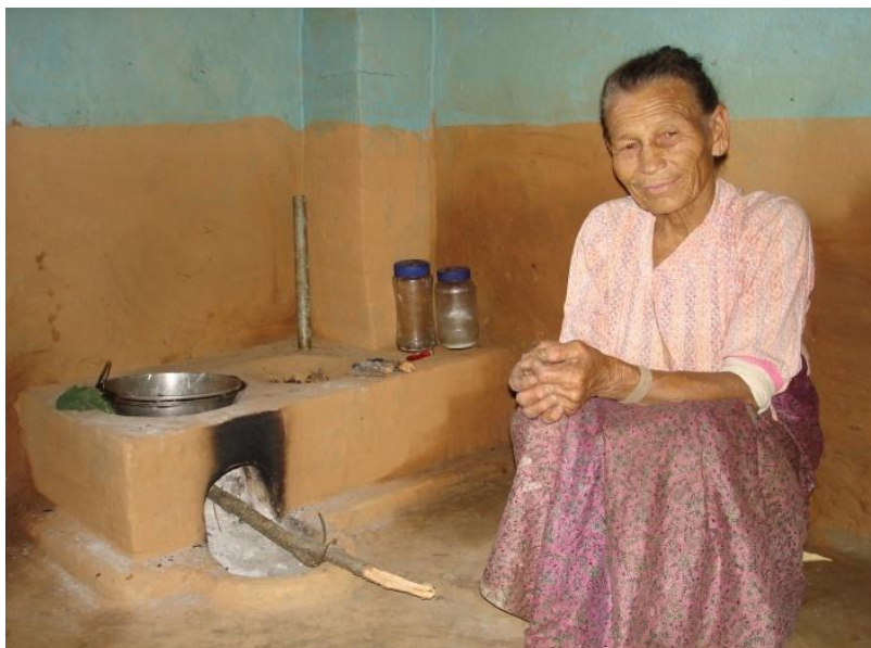
Smoke-free, safe, and energy-efficient cooking-place

Those who are initially motivated to participate in having this technology in their homes, should recruit at least ten other households within their community to engage in building new stoves, so that the oven builder's trip to the often remote areas can be made worthwhile.