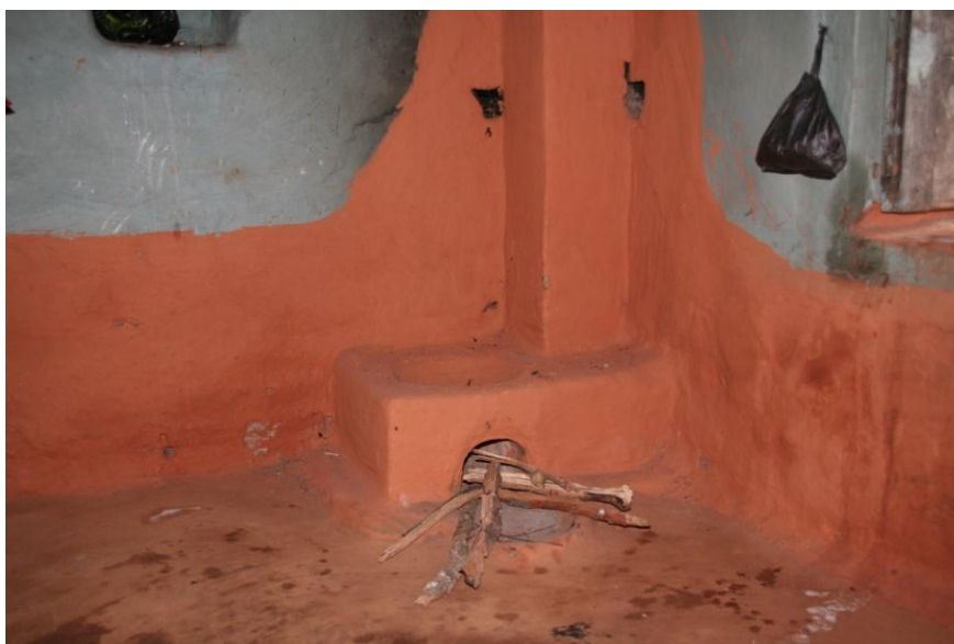
Simple stove with a smoke outlet

The idea of building cooking hearths with smoke flues is not new in Nepal. For years, the ESAP 2 program has been training stove-builders to produce such simple cooking hearths. Within a period of two weeks, a craftsman can be fully trained in the building of Chulo stoves. Necessary materials such as clay, cow dung and rice husks are most often available on site. Other components, such as iron rods and stove pipes, are easily obtained.