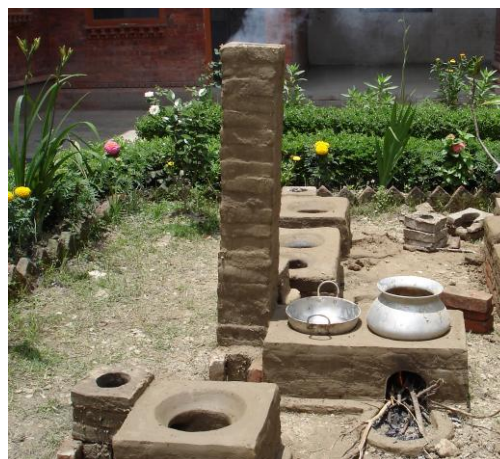
Various Chulo makes on a stove-builder training