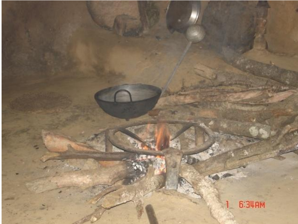
Open fireplaces in Nepalese homes

Another related problem is the lack of proper ventilation in traditional homes. Many young people come to the SKM Hospital suffering from chronic arterial vessel diseases, which are usually only known to “chain smokers” (e.g. smoker’s leg). The medical history shows that these patients are, in most cases, not smokers at all, but have nonetheless, inhaled high levels of thick smoke from the time of their early childhood onwards, because of this traditional cooking and heating method so widely used in Nepalese households.