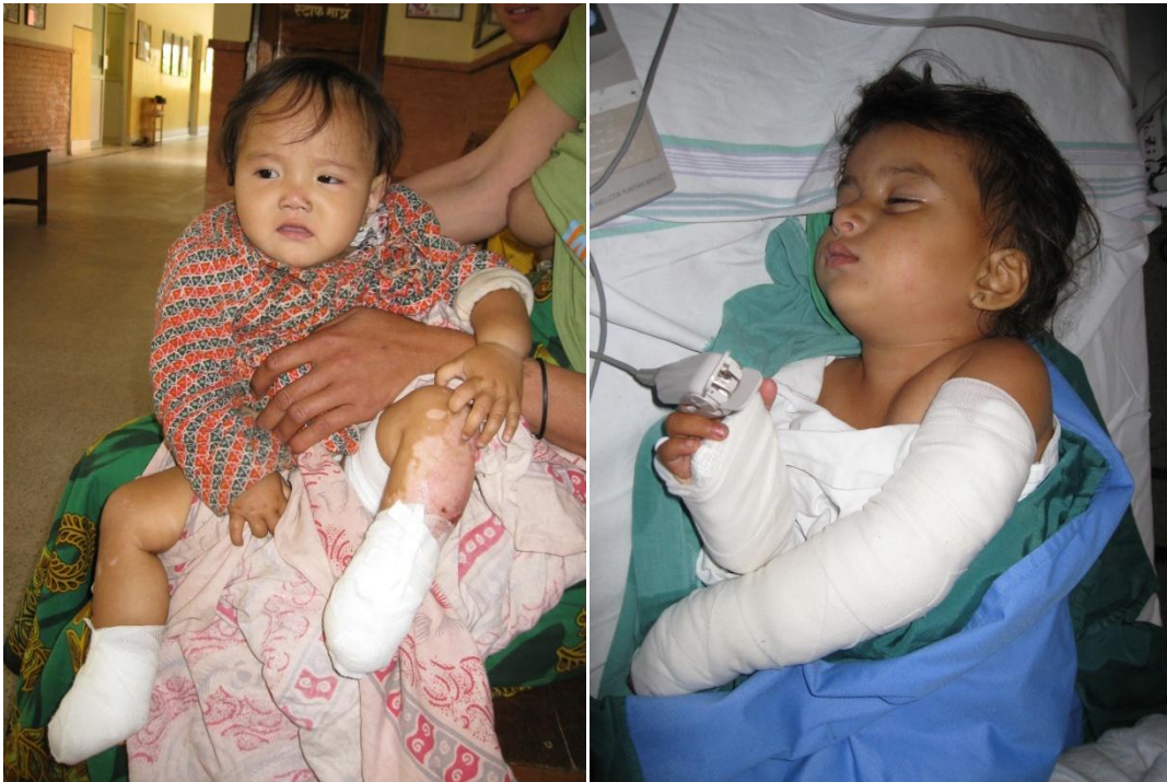
Patients with wounds on hands and feet (often infants)

In most cases, the victims of these accidents are children, who have stumbled or crawled into the fire, burning their hands and feet. Often, those injuries lead to the loss of limbs. These children also undergo massive contractions of their muscles, sinews and ligaments during the healing process, due to the lack of resources for appropriate treatment. This results in their having to face severe physical disabilities.