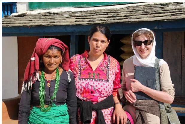
Doing an interview