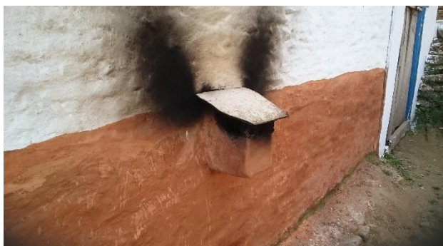
Clear indication: there is a stove in this house

Banjhkateri is in the west of Gulmi, a few hours by jeep from the border to the neighboring district of Pyuthan, our next stop. We started installing stoves in Pyuthan in January 2016 and