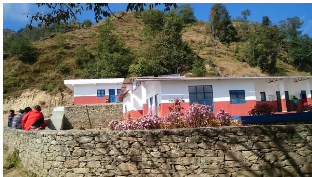
Hospital by Brepal in Banihkateri