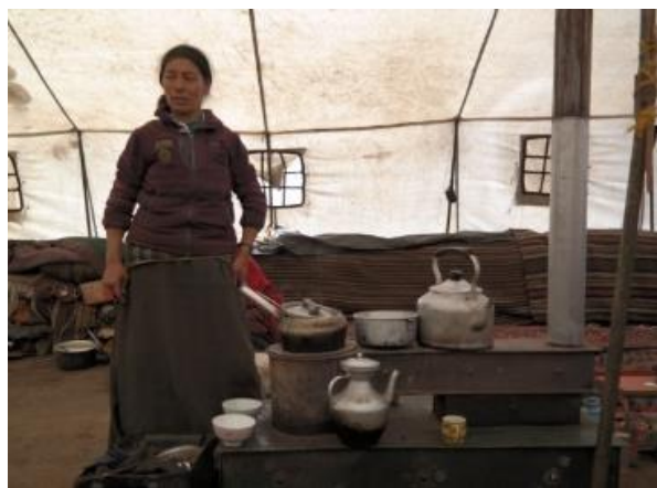
Mustang: Metal stove in a yurt

My second trip in early summer took me to the distant kingdom of Mustang; today part of Nepal. This was my first visit there; despite my long relationship to Nepal. Together with two friends and a professional guide I spent nearly three weeks in the high valley behind the Kali Ghandaki Canyon and saw the masked dances of the buddhist monks for the Tiji festival in Lo Mantang. Enormous monasteries and oasis-like villages were dotted amongst unforgettable landscapes.