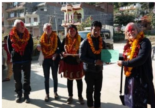
Handing out the certificates to the stove builders

In November we visited the district to review the results. Twenty stove makers were presented with their certificates after building 150 stoves. An extensive discussion with the men and women working on site was very valuable, and made clear the value of the close co-operation with the local authorities. The difficulties which the stove makers face as guests in the villages could also be discussed. Persuading people of the advantages of the smoke-free cooking stoves is not always successful. We also had the possibility to observe the building and installation of a stove from start till finish. The stove makers build their first 150 stoves after their training under supervision of an experienced colleague; it was a pleasure to see this in action. Later we visited several households and could discuss directly the experience people had gathered with their new stoves.