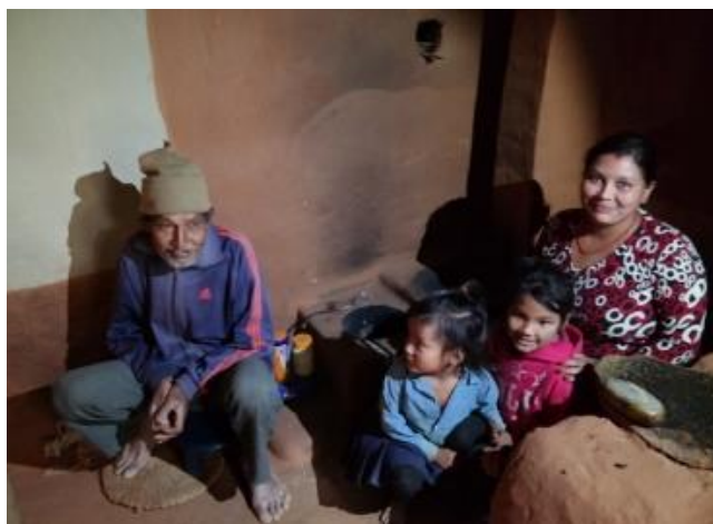
Family with a new stove in Pyuthan

Pyuthan: stove making has also picked up speed in Pyuthan, a neighbouring district of Gulmi. After obstacles which had to be overcome, more than nine thousand stoves could be built last year. Nonetheless the project had to be extended for six months due to an interruption caused by the elections which prevented completion of the planned twenty-three thousand stoves in time.