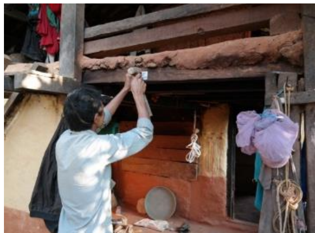
Attaching the stove ID to a house

Dolakha, Ramechhap and Kavre , our project area in the east which includes our environmental protection project was heavily affected by the earthquakes in 2015. The reconstruction work has only started in earnest in Dolahka. Most of the houses there were completely destroyed. In the meantime about one thousand houses and a corresponding number of stoves could be rebuilt. The authorities in Kavre and Ramechhap often only certified "limited damage" resulting in a reduction of the, in any case, meagre financial support. In consequence many people are only making minimal repairs and living with the result. According to official figures reconstruction has not started for 85% of the impacted houses, even now, two years after the earthquakes. Our stove makes are also often impacted; nonetheless they keep in touch with villagers in their region and offer support in installing a new stove whenever possible.