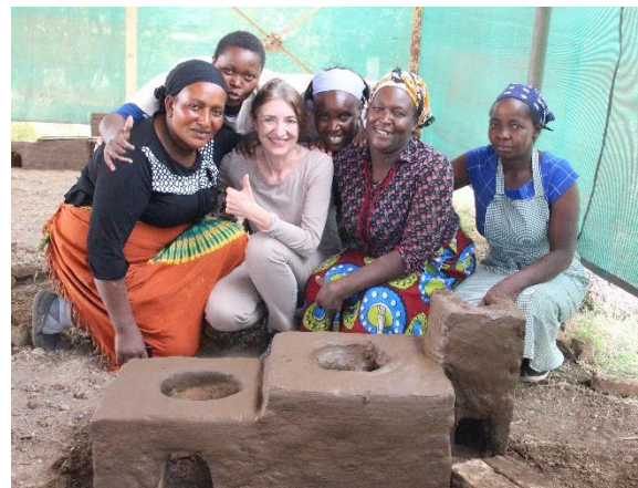
The first stove body completed

We started with a one-week training course in theory, clay preparation, brick making and stove body production. The following week we moved to the households and the stoves built in this section of the training were already intended for customers. In this phase the trainees learned the correct positioning of the stove in the house, the construction of the chimney, the attachment of the outlet and the coating. Under the guidance of the three coaches, the quality reached product level.