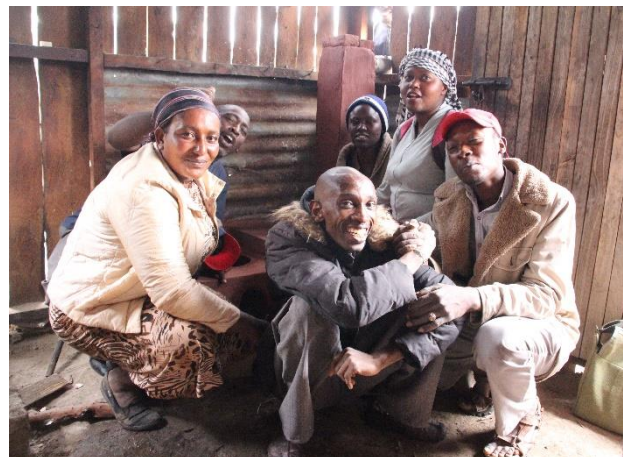
First stove in a household

In conversation with the people here you can feel that the people are still affected by the drought of last year. The disappearance of the forests promotes dehydration and agriculture suffers. Firewood is scarce. A bundle that lasts about a week costs already 300 shillings (about 2.50 Euros) and thus devours a large part of the weekly income. Water and wood are rare and precious. With the wood savings of the stoves, we meet a need of the population; so stoves are in great demand. Now our goal is to meet the demand.