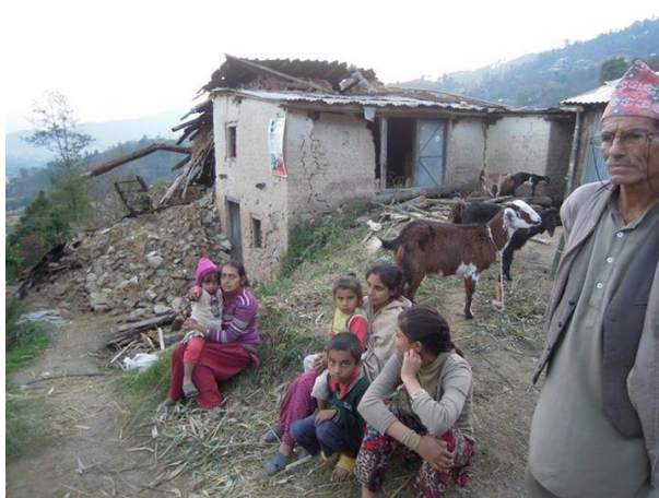
Damaged house in Sindhupalchok

The climate protection project after the earthquake