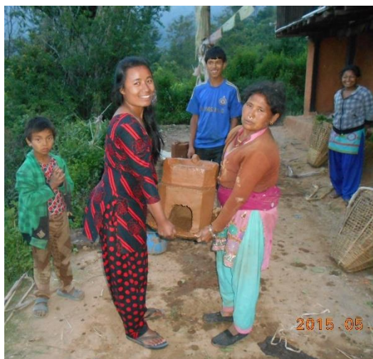
Handing over a rocket stove

Already after the first information about the extent of destruction by the earthquake, it was clear that the climate protection project had to be restarted almost from scratch. We have therefore made an application to Gold Standard to suspend the project for three years. Due to the obvious circumstances, which the project was not responsible for, the request was accepted. This means that for three years, we no longer had to provide proof of the CO 2 savings, but in return, we were not able to credit emission reduction certificates. The period of suspension of the project ran until the end of April 2018.