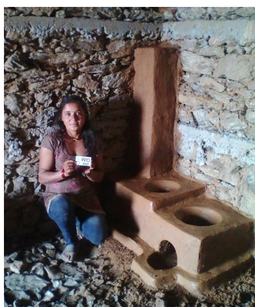
Stove in a new building in Dolakha

After the earthquake, the motto for the climate protection project was that each newly built or rebuilt residential building should receive a clay stove from Swastha Chulo Nepal. Smoke-free and clean living rooms from the beginning! As of July 2016, we started building the standard stoves again. In the district of Dolakha, there are almost 2 000 new stoves. In the two other districts, however, the stove construction has not yet started. Reason is slow reconstruction of houses. The state grants subsidies for the construction, but these are far from sufficient, so usually new houses cannot be built and the residents must continue to live in the shelters. New houses are the prerequisite for new stoves. Another reason for the sluggish stove rebuilding is the lack of stove builders in these districts.