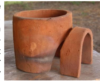
Liner from fired clay

Of course, we also used our stay to get to know Stephen and practice with him the processes of organizing stove building and reporting. Since our last visit more than two years ago, there have also been technical changes. The liner from fired clay, which forms the combustion chamber, was already standard at that time. Over the past two years, it has also been found that lining the furnace with a layer of cement, the so-called coating, significantly improves the durability of the stove. Therefore, almost all stoves are now built with a concrete coating.