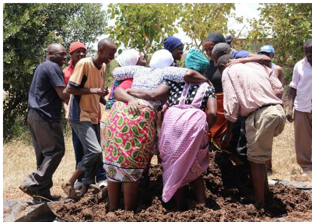
Clay mixing is teamwork

For these reasons, it was decided to make the stove with coating standard and offer it to all households. That's why our 12 candidates have been trained from the beginning in the production of the coated stove.