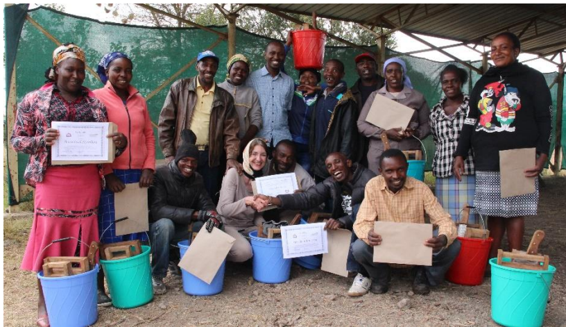
Trainers and students with certificates

The second week of training in the households of the municipality of Exrock left us with the impression that the ovens are in great demand. The households took on the tasks of clay preparation and brick production with dedication. We were welcome everywhere and were sometimes more served than we could handle. We visited several village meetings, always aroused great interest, and left them with a large number of new entries in the stove demand list.