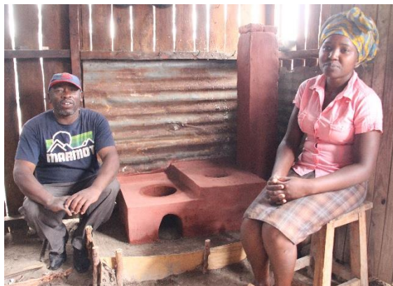
Stove with coating

In addition, the cement layer stove has a cleaner appearance with smoother surfaces, which significantly enhances the sense of value. We believe that this appearance does a lot to make the stove so sought after. Wood savings and health may be rational reasons, the heart desires a beautiful stove. Some households also paint it with red cement paint, which makes it even prettier.