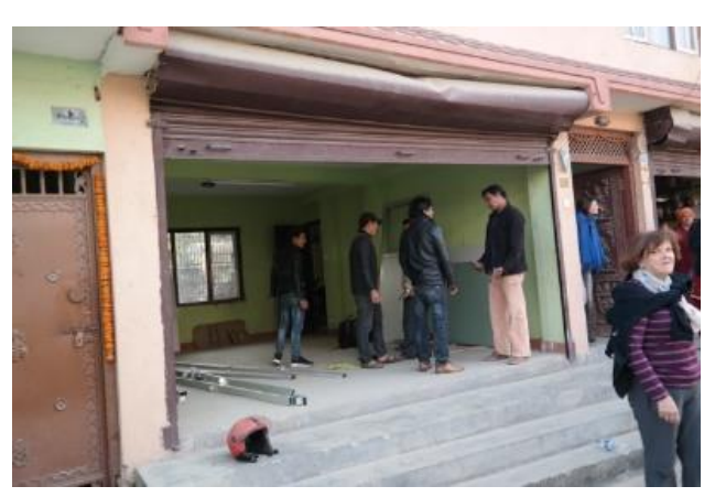
This is where the office for SCN is to be set up

tendency is for a cooking hut next to the house, because the kitchen is not provided in the model.