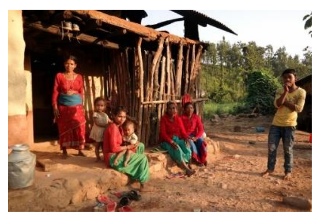
Household in Gulmi - future customers

The project is being carried out in cooperation with the AEPC (<u>Alternative Energie Promotion Center</u>), a government-related institution in Nepal, and registered with the SWC (Social Welfare Council) to comply with the legal framework in Nepal. In addition, local authorities in Gulmi and Pyuthan are involved and informed accordingly, and work permits are obtained.