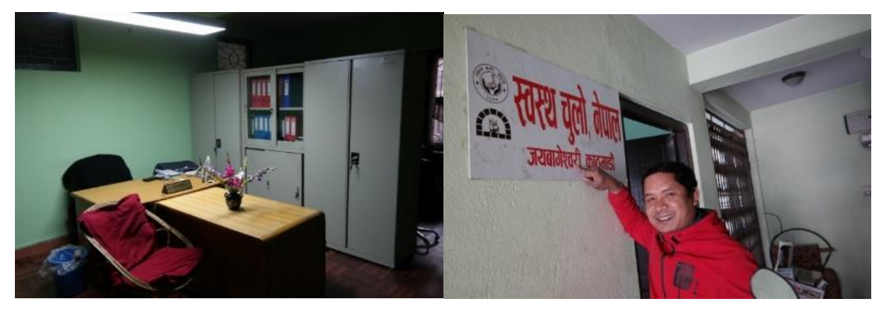
Finished! Office with 2 desks