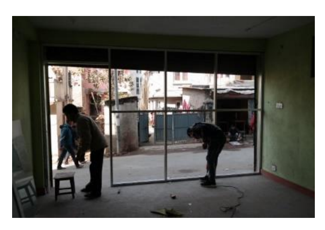
Interior fitting with separation to the street

The situation in the SCN office, used as living room by Anita and her family at the same time, was no longer satisfactory or professional. This issue was highlighted in the evaluation of the Pyuthan project by the Social Welfare Council (SWC). After extensive discussion and consultation, we decided to rent a separate room on the ground floor in the same building, in order to set up an office there and at the same time a storage room.