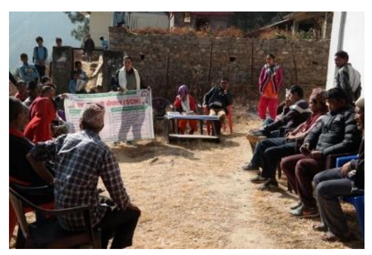
Village meeting in Bethanchowk, Kavre

Overall, it was again a busy but eventful time in Nepal. With many visits to friends and acquaintances, including a visit to the three children we presented in the Chulo Herald No. 17 – they are developing very well. There was a Christmas party at the childrens' home and the visits to the SKM Hospital, then the trip to the health-post in Dhadagoun and much more.