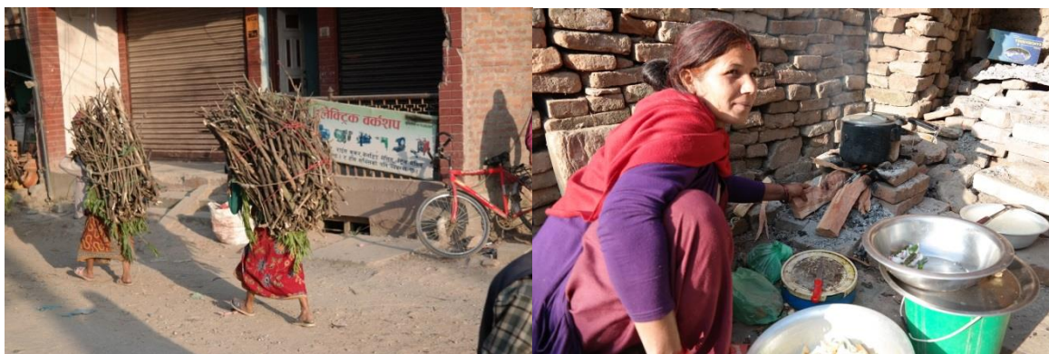
Firewood trade in Kathmandu

The month-long blockades of the Indian border starting in September 2015 have created dire shortages of fuel (diesel, petrol and gas), with consequences felt by everyone daily. At last delivery of petrol, diesel and food-stuffs has normalised but a renewed shortage of gas cylinders is causing problems and leads to a demand for alternative ways for cooking. Firewood is on sale and open cooking fires can be seen throughout the city.