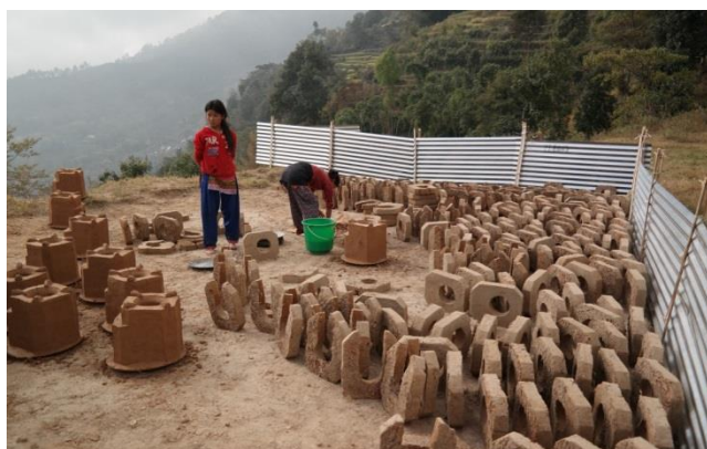
Rocket Stove production in Kavre